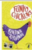
Poet Study: Benjamin Zephinah