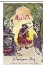
Macbeth by William Shakespeare