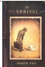
The Arrival by Shaun Tan