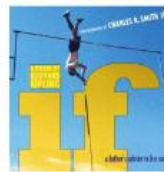
If by Rudyard Kipling