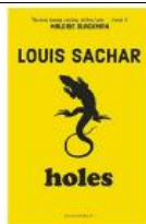
Holes by Louis Sachar